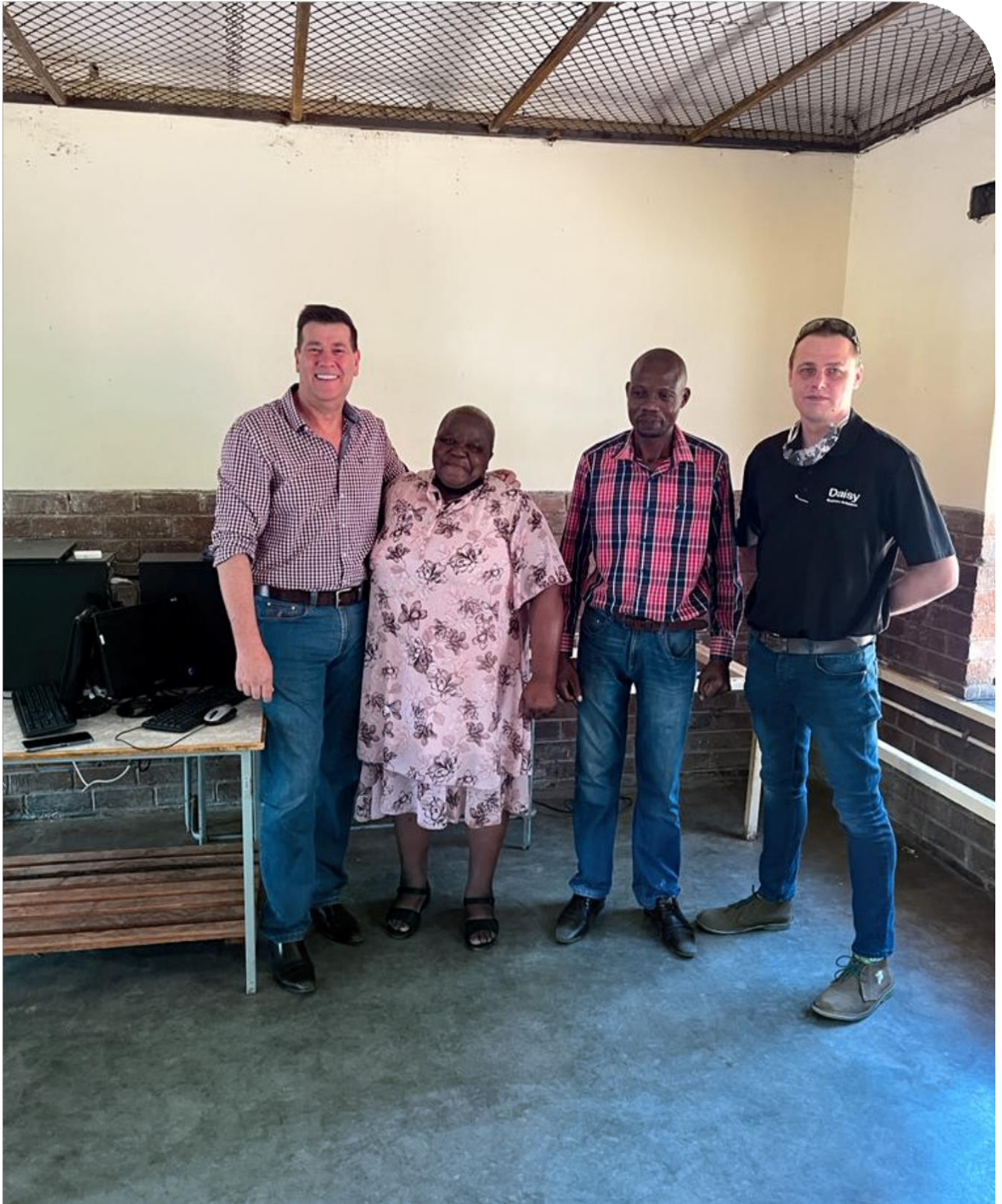
Donation of two computer to the library at Mahwahwah. Daisy business solutions donated a printer/scanner to the library.